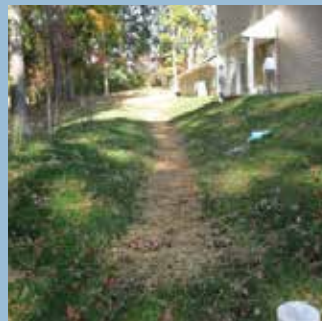
Open Drainage Swale