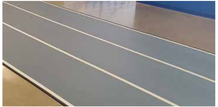
Proposed new track material

The Community Center track will receive an upgrade in May 2021. The existing track is original to the 1997 expansion and will receive a new product that is popular among indoor tracks across the country for its durability and ability to provide some impact resistance for walkers and runners. Additionally the track color scheme will change slightly to be more in line with the numerous upgrades that have been made over the last three years and will include new signage and new benches. During the track project, the gymnasium below will remain open and available for walkers and runners to exercise indoors. More information on exact project dates will be announced soon.