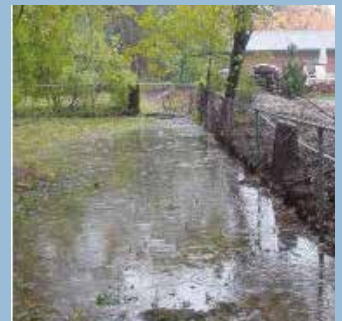
Blocked Drainage Swale